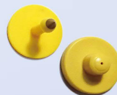
Ear Tag for Pigs PG-PROXT-UHF-04-B3