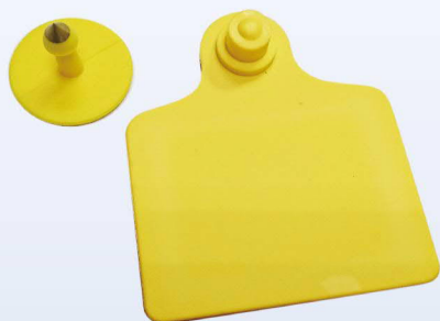
Ear Tag for Cows PG-PROXT-UHF-02-B3